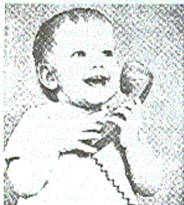
"Wow, another bank machine!"

We will be keeping track of what has already been mapped out. Remember, this activity is FREE and LEGAL!!